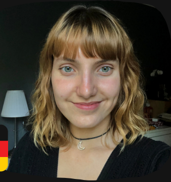
NELE (Accomodation &Transport)